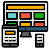
Platform BSD Online

Not just an interface, a pedagogical tool for teaching and learning.